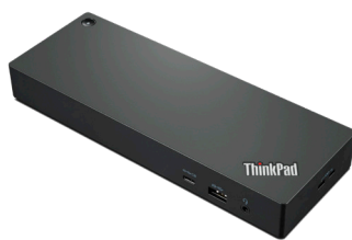
ThinkPad® Workstation Thunderbolt™ 4 Dock PN: 40B00300xx