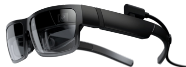
ThinkReality® A3 XR1 3G+32G